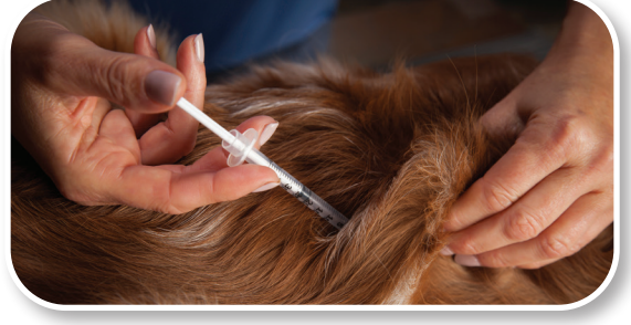
Press plunger as far as it will go, pull needle out, and dispose of syringe appropriately. Place vial back in the refrigerator.